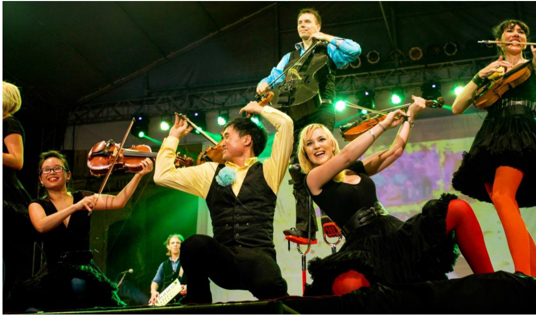
DeepBlue performing Who Are You in Vietnam.