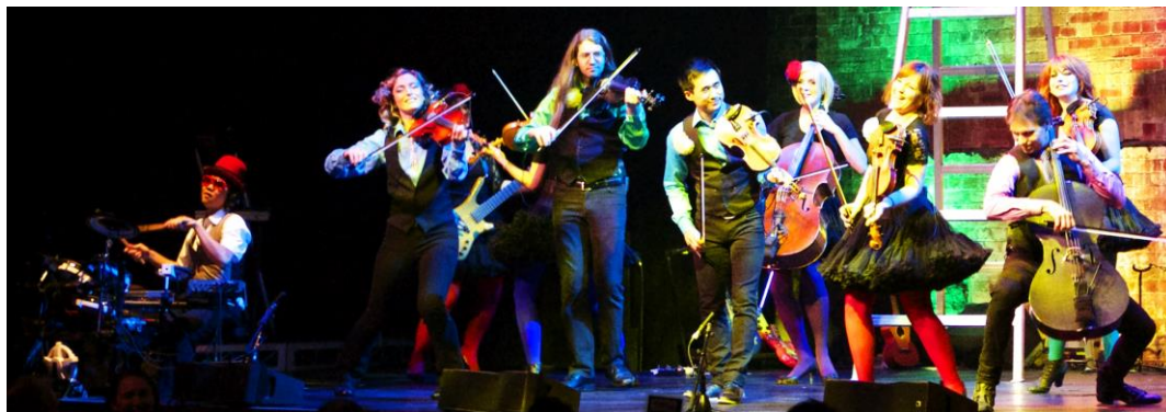
Who Are You at the Brisbane Powerhouse