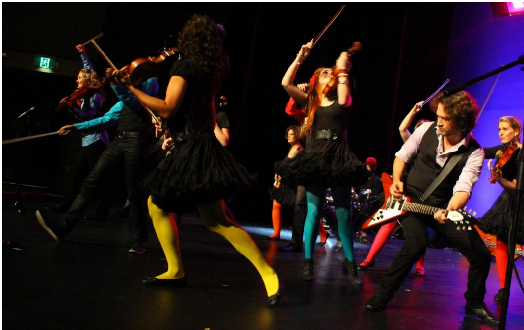
DeepBlue performing Who Are You , Noarlunga, SA.

High Res versions are available upon request.