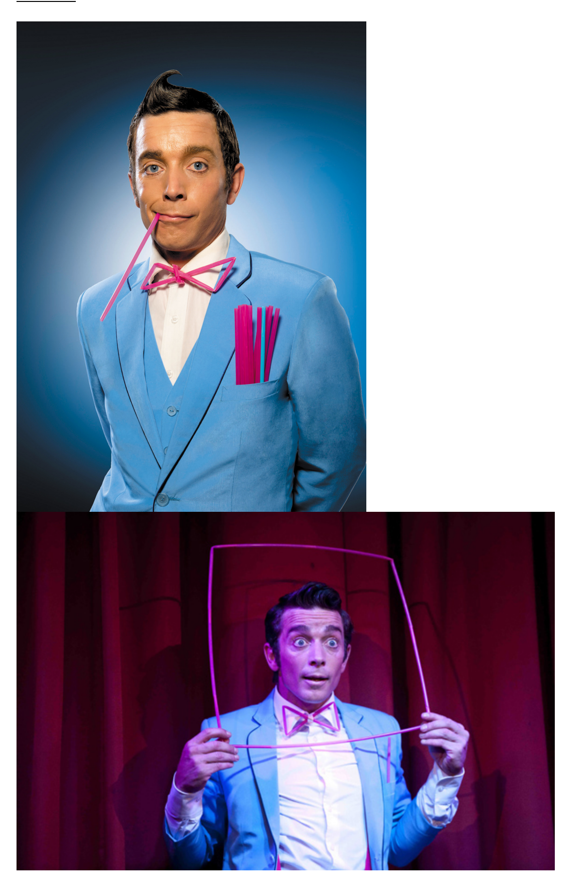
[DANDYMAN] Page 8 of 12